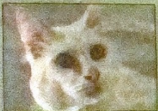
PETS OF THE WEEK... Meet beautiful Alaskan She's a very sweet and loving girl. Page 12