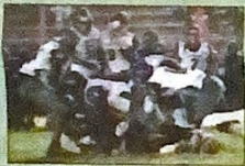
SPORTS... Narbonne edges Gardena on second try. Page 3

Find this week's stories, plus exclusive content at gardenavalleynews.org. Follow us at: Facebook.com/Gardena-Valley-News-140655699304726. Tweet us: @gardena_news; And find us at: Instagram.com/gardenavalleynews. Tag us, follow us, send us comments, pics and videos.