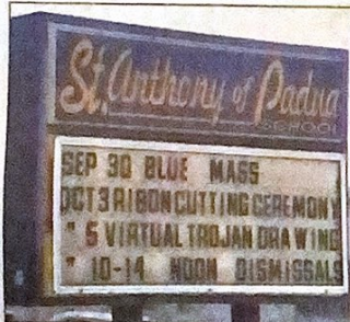
Above, the St. Anthony Church/School marquee notes the special Oct. 3 celebration.